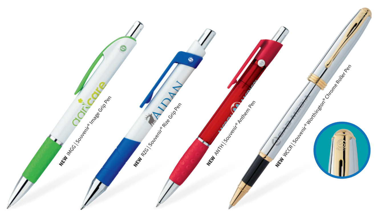
\label{thm:continuous} \textbf{Updated product images are for illustration purposes only.} \textbf{Actual product may vary}.