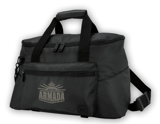
16235 KAPSTON® Town Square Duffel as low as $52.19(C) | min. 25