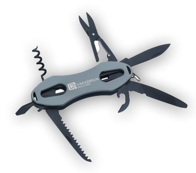
21114 Good Value<sup>™</sup> 7-In-1 Multi-Tool as low as $14.41(C) | min. 50