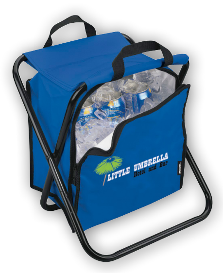
45006 Koozie® Chair Cooler as low as $35.77(C) | min. 48