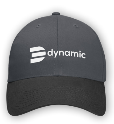
7360 Pro-Lite Deluxe Cap as low as $7.73(C) | min. 48