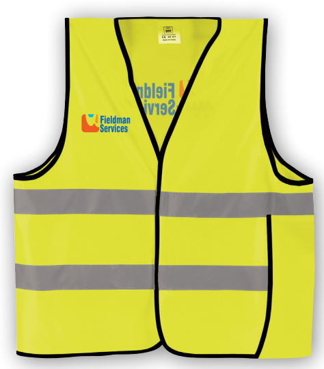
50043 Reflective Safety Vest as low as $27.97(C) | min. 25