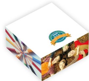
SNC3B Souvenir™ Sticky Note® 3" x 3" x 1-1/2" Cube as low as $6.41(C) | min. 90