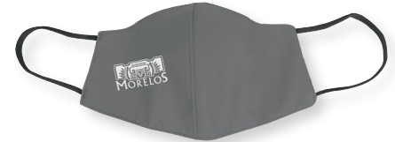
41164 Good Value™ Comfy Face Mask as low as $8.02(C) | min. 100