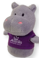
CT838 Chelsea Teddy Bear™ Shorties as low as $7.95(C) | min. 150 CAD pricing begins in March.