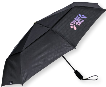
2285 Shed Rain™ Vortex™ V2 Vented Compact as low as $52.19(A) | min. 24 CAD pricing begins in March.