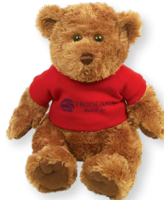
CT978 Chelsea Teddy Bear™ Traditional Teddy Bear as low as $20.27(C) | min. 48 CAD pricing begins in March.