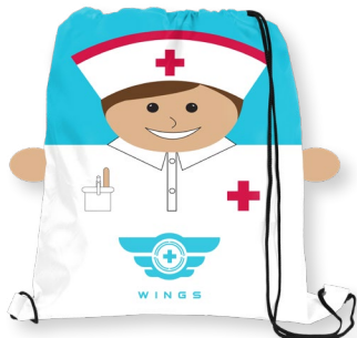
A448 Hometown Helpers Sport Pack as low as $8.44(C) | min. 150 CAD pricing begins in March.